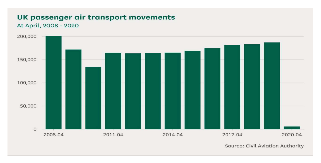
Figure 1: UK passenger air transport movements

At the beginning of the 2020 the world's airlines were operating around 24,000 passenger jets with at least 50 seats. Today that number is lower by approximately 80%. The impact of COVID-19 on UK passenger air transport movements is drastically reduced, as shown in Figure 1 [11].